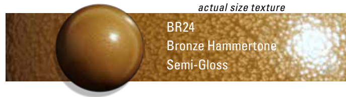
actual size texture BR24 Bronze Hammertone Semi-Gloss

See reverse for additional available Standard Color finishes.