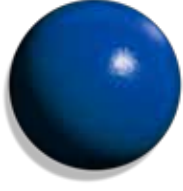
BL468 Blue Hammer tone Semi-Gloss