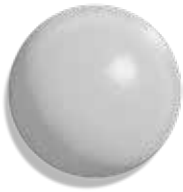
GR1389 Gray Hammer tone Semi-Gloss