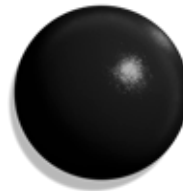
BK62 Black Hammertone Semi-Gloss