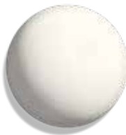
WH260 White Hammertone Semi-Gloss

The two textured finish selections that offer all of the benefits listed above are Hammertone Finish and Leatherette Finish: