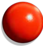
RD15 Red Hammertone Semi-Gloss