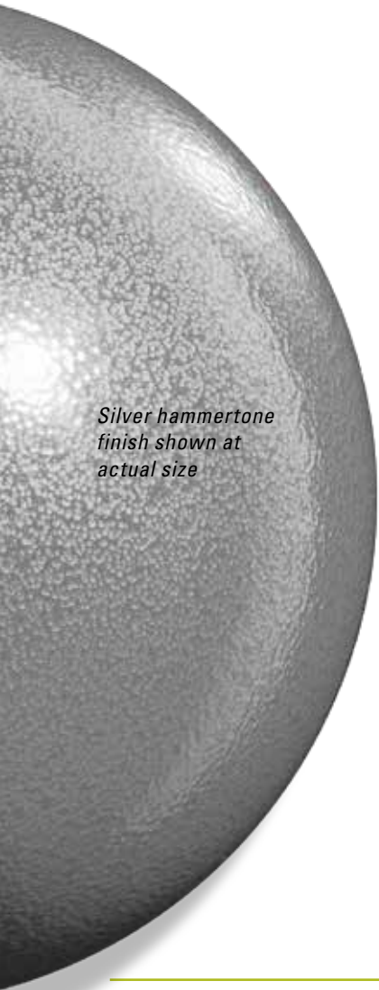
Silver hammer tone finish shown at actual size