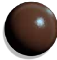
C012 - BR376 Chestnut Hammer tone Semi-Gloss