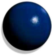
BL467 Dark Blue Hammer tone Semi-Gloss