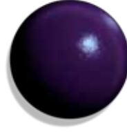
C013 - PL92 Plum Hammer tone Semi-Gloss