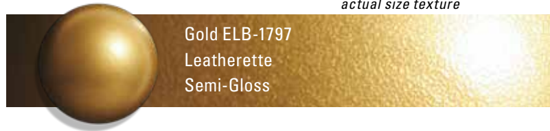
Gold ELB-1797 Leatherette Semi-Gloss