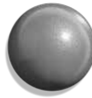
GR05 Silver Hammertone Semi-Gloss