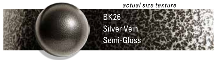
actual size texture BK26 Silver Vein Semi-Gloss