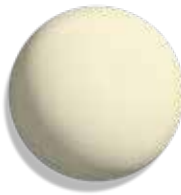
BG38 Beige Hammertone Semi-Gloss