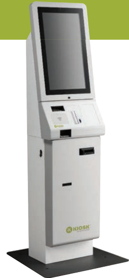
Floor-standing with Card Dispenser & Bill Acceptor