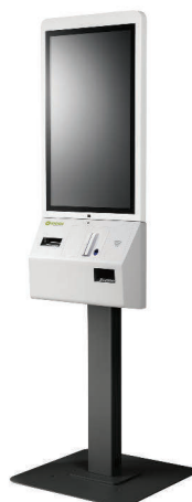
Single Sided Operation