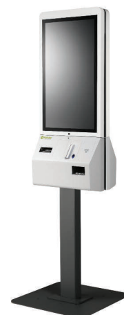
Dual Sided Operation