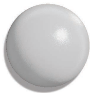
GR1389 Gray Hammer tone Semi-Gloss