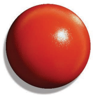
RD15 Red Hammertone Semi-Gloss