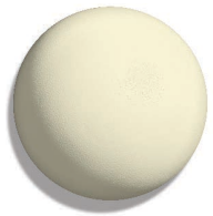
BG38 Beige Hammertone Semi-Gloss