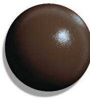
C012 - BR376 Chestnut Hammer tone Semi-Gloss