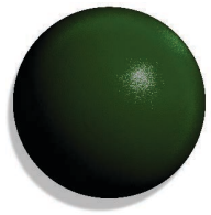
GN220 Green Hammertone Semi-Gloss