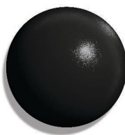
BK62 Black Hammertone Semi-Gloss