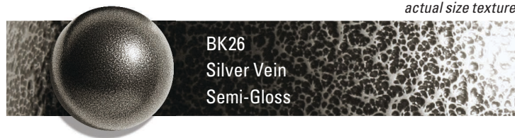
BK26 Silver Vein Semi-Gloss