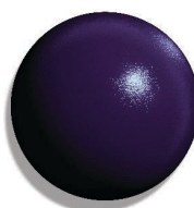
C013 - PL92 Plum Hammer tone Semi-Gloss