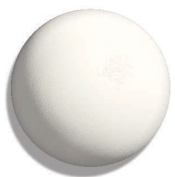
WH260 White Hammertone Semi-Gloss