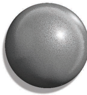
GR05 Silver Hammertone Semi-Gloss