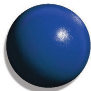
BL468 Blue Hammer tone Semi-Gloss