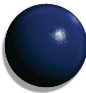
BL467 Dark Blue Hammer tone Semi-Gloss