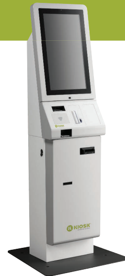
Floor-standing with Card Dispenser & Bill Acceptor